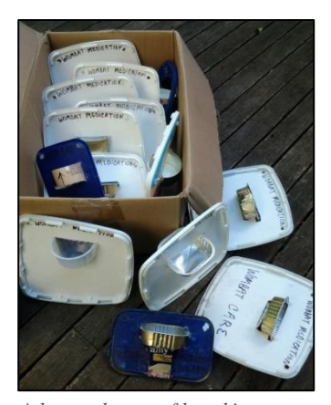
A low tech way of breaking the life cycle of the mite

There is, however, a cure which works without the need to capture the wombat. The idea is to break the life cycle of the mite. A flap is made using the lid of an ice cream container which is hung with string over the entrance of the burrow. The medicinal dose is in a can attached to the flap and as the wombat leaves the burrow the treatment dose upends onto the wombat's back. Ingenious! Treatment lasts 15-20 days. Every 5 days the medicine needs to be replaced. Mange treatment kits are available, among other things, on the Rocklily Wombats website <a href="https://www.rocklilywombats.com">www.rocklilywombats.com</a> and I believe there is a new single dose available or close.