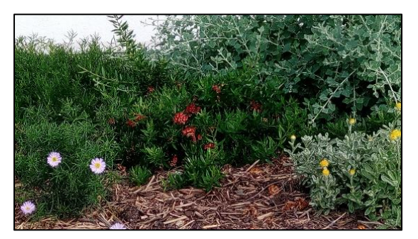
One of three planter boxes 24/1/2019

Looking really good. You could be forgiven for thinking [since I didn't think to photograph the planter box itself] that this is a little native garden in miniature in someone's yard. Not plants enhancing a concrete box in a retail concrete precinct. It's good to let locals know how well Australian native plants can look.