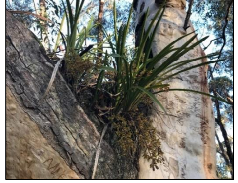
Native Cymbidium orchid