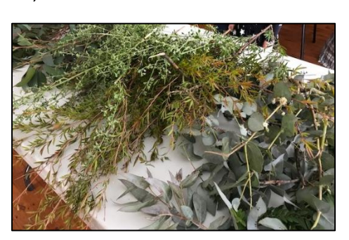
Blue gum, kangaroo mint, lemon-scented tea

Next, do the same with a few leaves of kangaroo mint (aka native mint). Inhale. Again. Again.