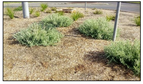
Roundabout detail 24/1/2019