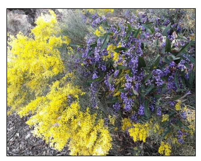
A dazzling display of prostrate Acacias and Hardenbergias

Visiting the Sculpture Garden at the Australian National Gallery beside Lake Burley Griffin is a joy in all seasons. Since c1982, the randomly planted, white trunked Eucalyptus mannifera have grown to be majestic sentinels with open canopies that filter light to the indigenous plants below and moderate the prevailing winds.