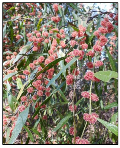
Apricot blossoms of Acacia leprosa

The winter garden enjoys a microclimate created by heat stored & reradiated from the massive north facing, bush-hammered concrete walls of the Gallery and grey slate paving. Cold winds are excluded resulting in winter flowering of Philothecas , Indigofera australis , Croweas , and Grevilleas .