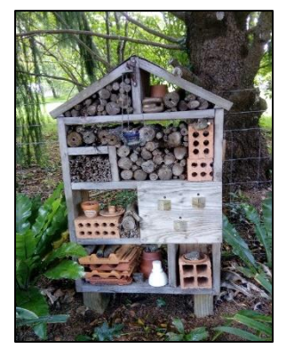
The insects that the world cannot do without are the pollinators; mainly the bees. Without the pollinators the world's food supplies are under threat and, unfortunately, honeybee populations worldwide are under serious attack from the Varroa Mite (varroa destructor).

Ann and Bob now have two such structures in their garden. They were, of course, insect/bee hotels and they have become ubiquitous as more people become aware of the benefits of attracting useful insects to assist in organic and sustainable gardening.