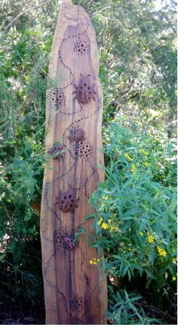
A unique insect hotel. "Beetle surfboard" created by Sylvia David

With the exception of a few rare exceptions (the ladybug), insects are generally frightening, to the point of causing in some real phobias. Yet their usefulness is great and their observation fascinating. Fear of the insect is primarily cultural, we are not taught to love insects.