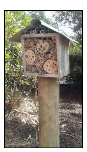
The hotel that Bill built.