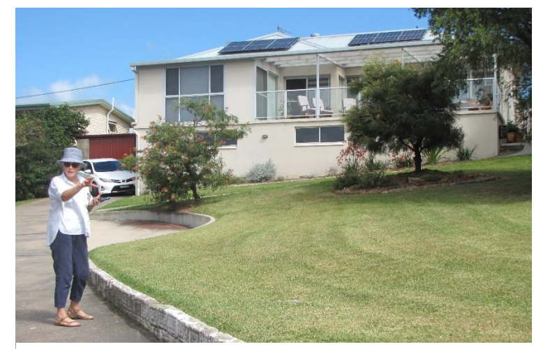
Shane discusses aspect and prospect, terms we were to become familiar with as the day progressed.

Starting at the entrance to the garden, we discussed the importance of looking at the aspect of a house and garden – what is first seen on entering a property.