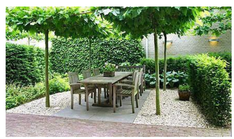
Enclosure – A garden room defined by borders of various materials

It is vital to start formative pruning when planting and to prune little and often to ensure a clear trunk, spreading canopy and desired height.