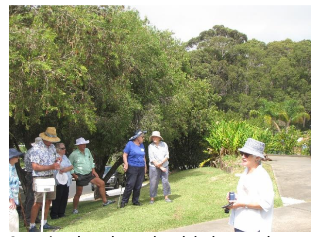
Screening along the road, and the borrowed landscape of the forest provide privacy,

but improving the planting on the northern boundary is necessary to provide adequate screening