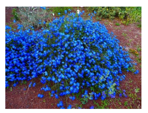
The spectacular L. biloba from Moora is possibly the most intense blue of any plant. The plant below is L. "Ultra Violet" a hybrid of L. biloba and L. formosa bred by Greg Lamont of Gosford in the 1980's