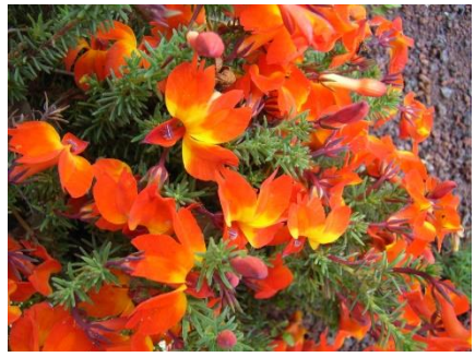
The brilliant orange of L. formosa "Starburst"