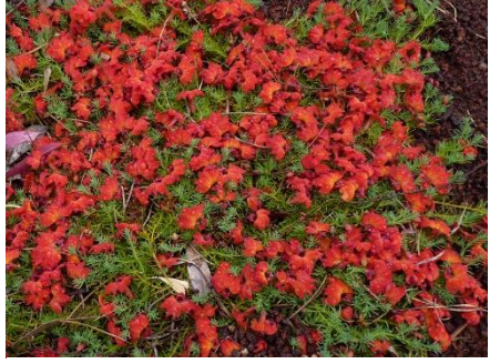
L. formosa red flowered prostrate form