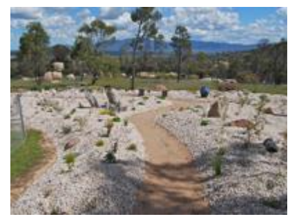
Panrock Ridge, Stawell. Garden of Neil and Wendy Marriott, growers of a huge diversity of Australian plants. Mounded planting beds provide good growing conditions, and ensures that should heavy rains fall, excess water drains away.

Panrock Ridge also holds the Grevillea collection