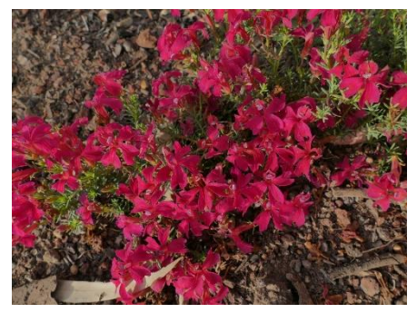
The small woody shrubs of Lechenaultia formosa come in a wide range of colours. L."Lola", a pink form has been in cultivation since the 1970's