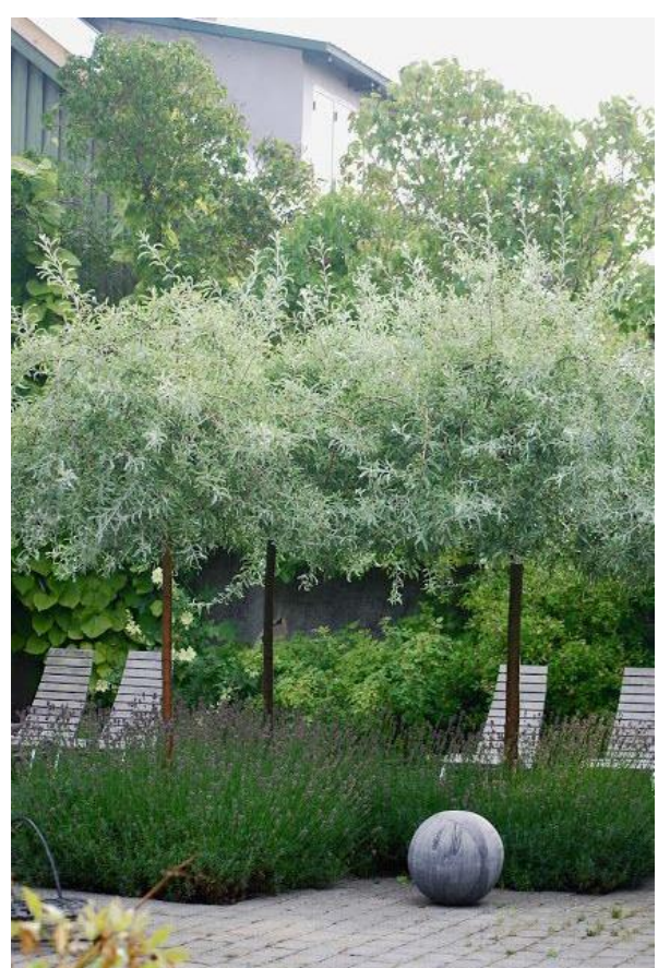
Screening and a sense of enclosure

We started to have an interesting discussion on how to open up the garden, overcome the slope and prevent stormwater runoff problems, but ran out of time, as we had another garden to visit in the afternoon.