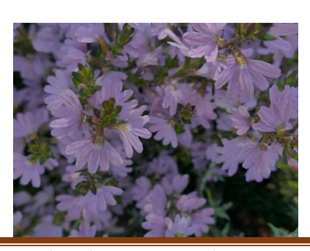
Plants which should prove adaptable in our gardens, the suckering Dampiera alata, and on the left, Scaevola aemula, which comes in a range of flower colours, from white through pink mauve and purple.