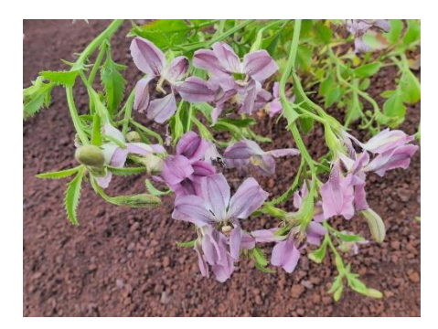
The delightful mauve pink flowers of Goodenia macmillanii exude a sweet chocolate fragrance.