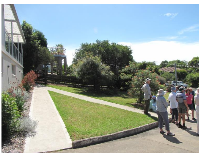
The rear garden has a cross slope and structures that currently limit the view of the garden.

We started to have an interesting discussion on how to open up the garden, overcome the slope and prevent stormwater runoff problems, but ran out of time, as we had another garden to visit in the afternoon.