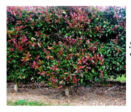
Syzygium smithii 'Red Head'

Red Head is an attractive large shrub / small tree with glossy rounded, deep green foliage. New growth flushes red to deep claret than changes to chocolate before hardening off the dark green foliage. The dense foliage can be pruned down to 1.5m high and is fire retardant. This tree is one of the best forms for pleaching. It is highly Psyllid and borer resistant, and does not get Myrtle rust. Its compact size makes it a great shade tree if the first 1.8 metres is cleared on the trunk. It is great for screening or as a feature tree, especially with its beautiful red new growth twice a year.