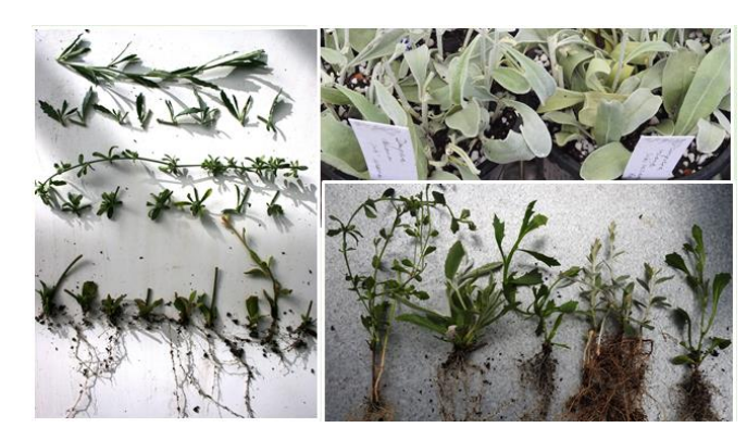
All parts of a plant can be used for propagation, stems cut into single nodes, suckering roots removed and treated as cuttings, and single leaves, which is discussed further.

Many Goodenia species present with suckers appearing from the central root system of the plants or along the adventitious undergrown roots as they spread under that surface of the soils. These are able to be collected, intact any time of year in bush. They usually strike readily, and are an easy learning method. Dampiera species, particularly, grow from suckers or shoots.