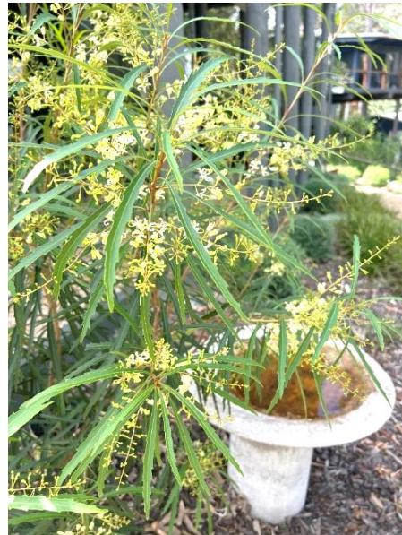
Lomatia myricoides flowering beautifully and full of bees. This plant got extra hand watering from the outdoor bath during dry weather. The garden has no other supplementary watering.