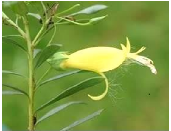
Eremophila maculata 'Aurea' Eremophila SG Newsletter 121

She has since also been involved in the Queanbeyan River Corridor Management Committee and Queanbeyan Landcare.