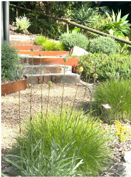
Billy buttons - Pycnosorus globosus grown from seed.

Members recently visited this newly established Narooma garden, and Alison provided some updated photos to reflect how quickly plants have established over recent months.