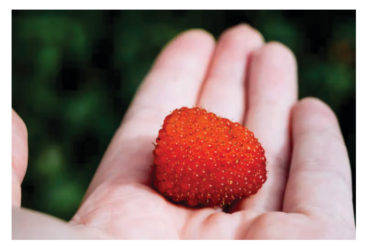
Our native raspberry is becoming popular.

In recent years, the native raspberry, Rubus probus , has achieved celebrity status as a prickly, quick growing bramble with a good fruit. But like its relative, the blackberry, Rubus fruticosus , you have to work hard to get fruit and rarely come away unscathed. That's why it was big news when a thornless specimen was found and propagated. This will make a big difference to the cultivation of our native raspberry.