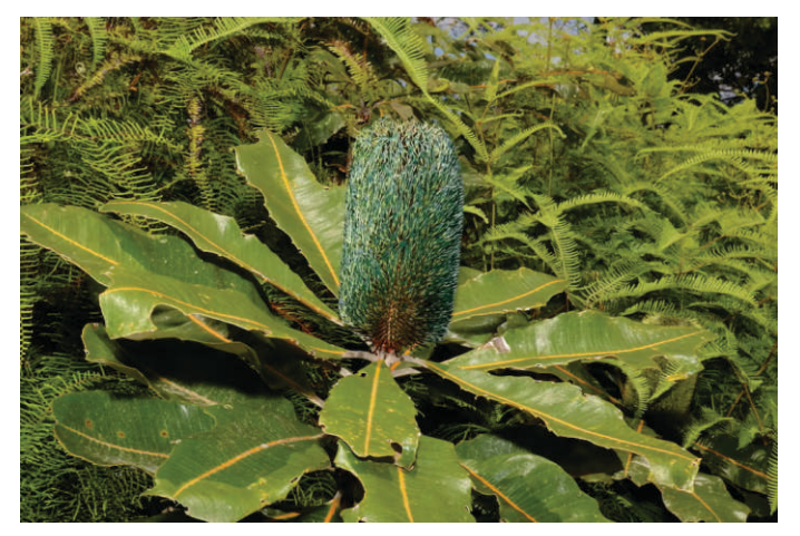
The charismatic and well-photographed Banksia robu r from NSW and Queensland. Greg Tasney

Just as some animals receive less research and conservation attention than others because they aren't as charismatic, there is also a similar charisma deficit for some types of plants. Many groups of Australian shrubs or trees with spectacular floral displays have comprehensive, or even complete, photographic records. For example, all 176 of Australia's Banksia species have been photographed.