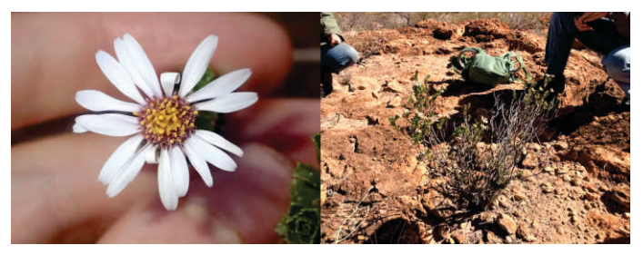
The first identified field photographs of Olearia eremaea , taken during the Desert Discovery expedition to Yeo Lake, Western Australia in 2022. Thomas Mesaglio

One example is the daisy bush Olearia eremaea , which is only found in WA's arid interior. First described in 1990 and illustrated with black-and-white line drawings, it was not until more than 30 years later that this species was first photographed, at Yeo Lake, a remote nature reserve roughly 200km northeast of Laverton.