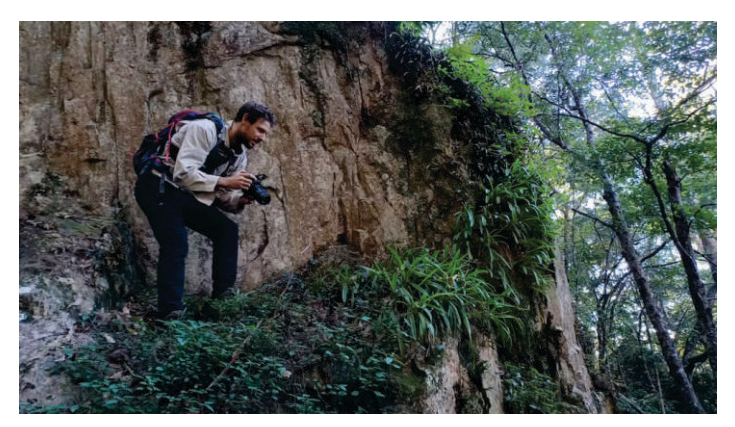
Photographs are valuable for providing extra information, such as habitat and other species growing nearby. Peter Crowcroft

Photographs of plants capture information that can be lost from dead, dried plants, such as flower colour. They also provide ecological context and form the cornerstone of many field guides and education resources.