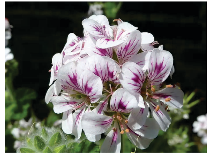
Native geranium? The Pelargonium australe is the native plant most commonly thought of as a geranium.

Most of the Australian native plants commonly called geraniums are in fact pelargoniums. You may have stumbled across Pelargonium australe , the most common of our seven species, which is spread across much of southern Australia.