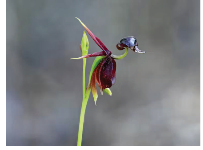
Australia's flying duck orchid (Caleana major) is world-famous for its resemblance.

We have some of the most iconic orchids as natives, such as the remarkable flying duck orchid and the stunning Queen of Sheba. Our 1800 species mostly grow in our tropical and subtropical areas.