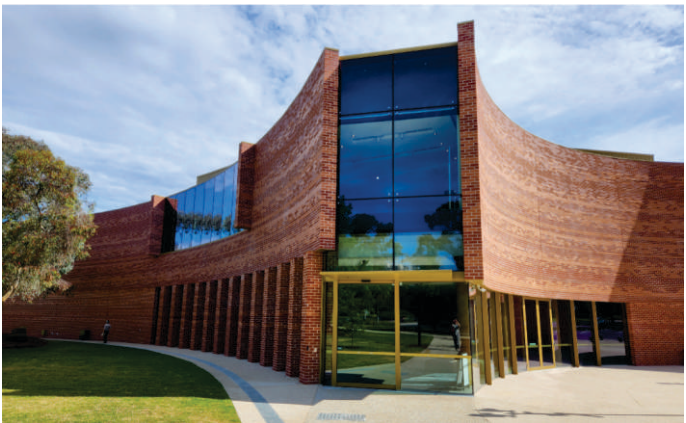
The Round. To see more on the new venue https://youtu.be/ZMyW380IU1k

• Sundowner Caravan and Cabin Park, half an hour from The Round, either paying tolls on Eastlink or tackling several traffic lights. The park has space but 85% are permanent. Cost is $34 per night, 7th night free. Visit www.sundownercp.com Email: sundowner@bigfoot.com.au Ph: 03 9546 9587. Address: 870 Princes Highway, Springvale 3171.