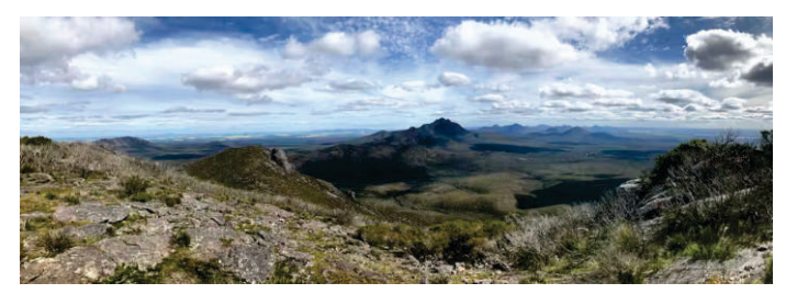
Western Australia's Stirling Range, one of the major hotspots in Australia for unphotographed plant species. Thomas Mesaglio

All three regions are characterised by remote environments that are often difficult to access.