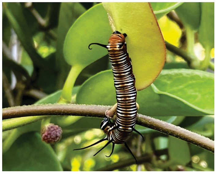
Leader of the 2024 Hoya pruning squad. Common Crow butterfly caterpillar. JM.