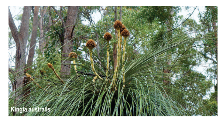
SUBLIME TO THE RIDICULOUS