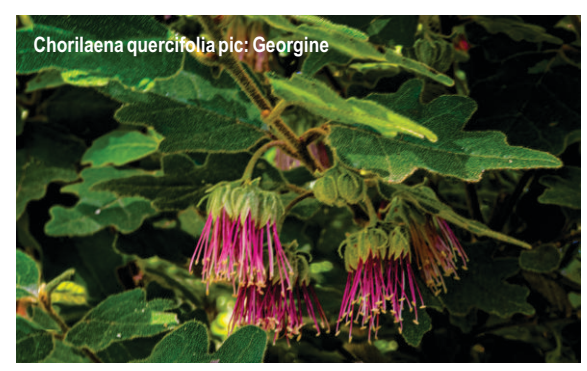
quercifolia, a plant from the Karri forests of Western Australia - it is always surprising to find plants thriving in places far removed from their natural habitat.

The bush to the north of the house had been burnt about six weeks