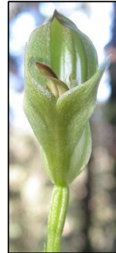
Pterostylis curta Jul-Aug