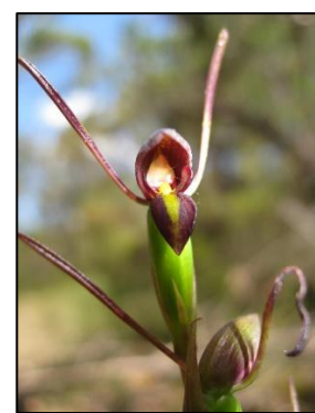
Orthoceras strictum Dec-Jan