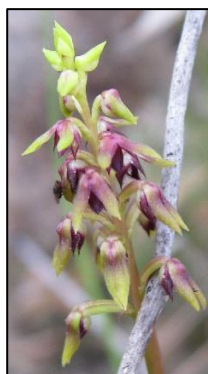
Corunastylis ruppilii Summer-Autumn