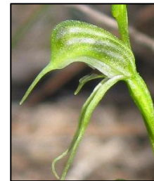
Pterostylis daintreana May-Aug