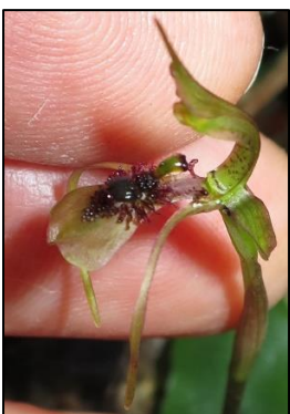
Chiloglottis seminuda June