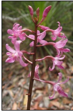
Dipodium roseum Nov-Jan