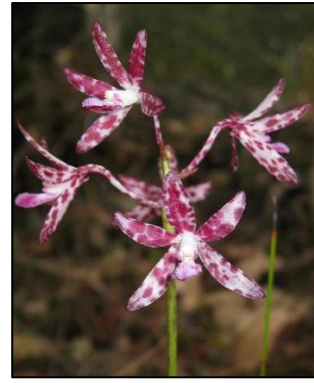
Dipodium variegatum Dec-Mar