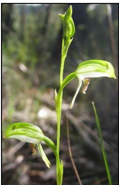
Pterostylis longifolia May-Aug