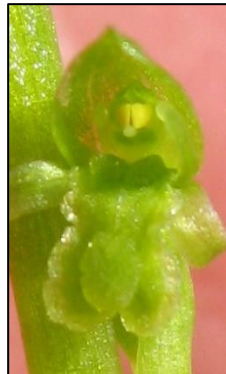
Microtis rara Sep