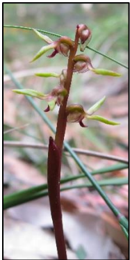
Genoplesium baueri Jan-Apr