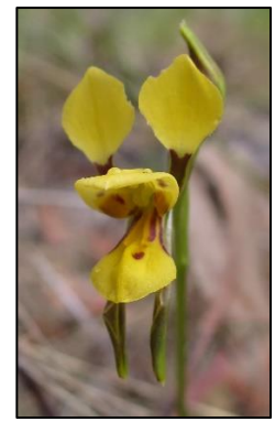
Diuris aurea Sep-Oct