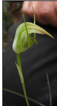
Pterostylis acuminata Mar-May