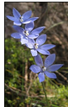
Thelymitra ixioides Aug-Sep