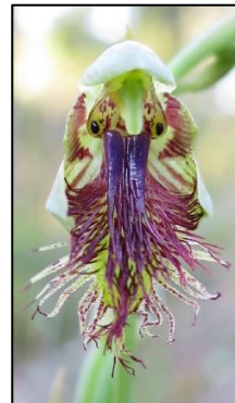
Calochilus campestris Spring