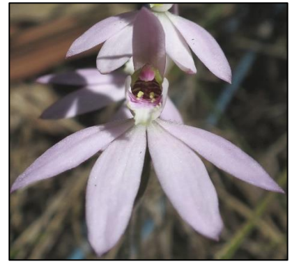
Caladenia carnea Spring