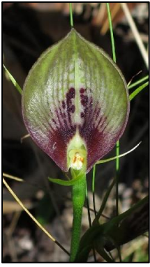
Cryptostylis erecta Summer