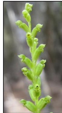
Microtis unifolia Nov-Dec