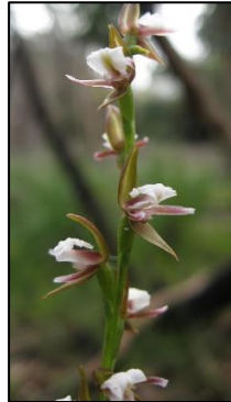
Prasophyllum brevibracte Jul-Aug