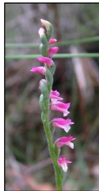
Spiranthes australis Dec-Apr