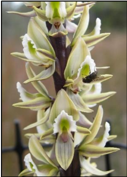
Prasophyllum elatum Aug-Sep