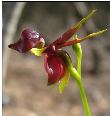
Caleana major Spring