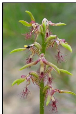
Corunastylis fimbriata Summer-Autumn