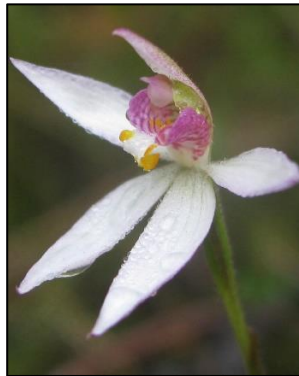
Caladenia alata Spring