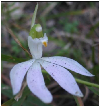
Caladenia catenata Spring