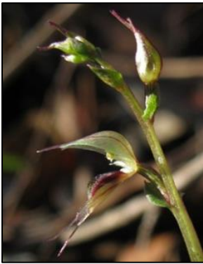
Acianthus pusillus Autumn-Winter

The Orchidaceae family is the largest and most successful in the world and many terrestrial species are growing in Ku-ring-gai Wildflower Garden and they emerge and flower at various times in the year. They are monocotyledons with three sepals and three petals, but one of the petals in most species is greatly modified to form the labellum or tongue. Fuller descriptions of these plants can be found in “notes” on our Walks & Talks page Australian Plants Society North Shore Group website: https://austplants.com.au/North-Shore/ Detailed botanical descriptions are given on the PlantNET website: plantnet.rbgsyd.nsw.gov.au Excellent images can be found on the Hornsby Library website: www.hornsby.nsw.gov.au/library under heading: eLibrary then find Hornsby Herbarium.