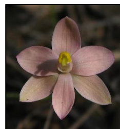
Thelymitra carnea Sep