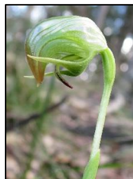
Pterostylis nutans Jun-Aug