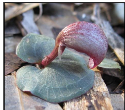
Corybas aconitiflorus May-July