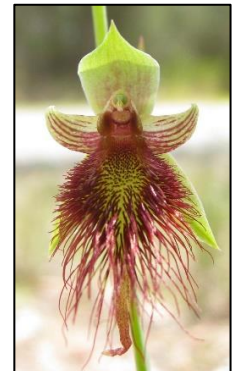
Calochilus paludosus Spring