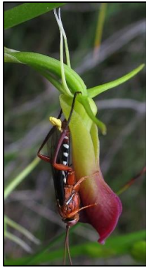
Cryptostylis subulata Nov-Jan