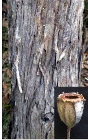
Angophora hispida (Dwarf Apple)