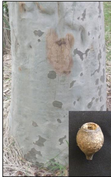
Corymbia maculata * (Spotted Gum)