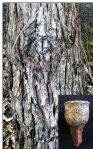
Eucalyptus robusta * (Swamp Mahogany) Bark - crumbly