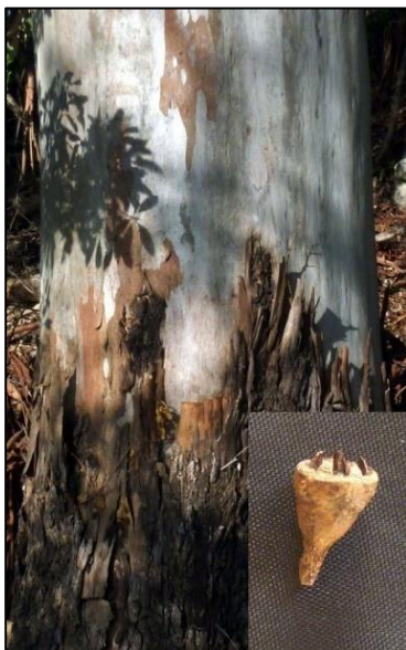
Eucalyptus saligna (Sydney Blue Gum)