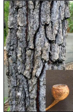
Eucalyptus sideroxylon * (Red Ironbark) Bark - very hard