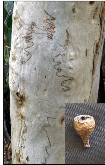
Eucalyptus haemastoma (Scribbly Gum)