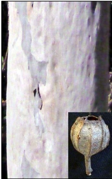
Angophora costata (Sydney Red Gum)