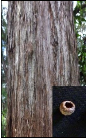
Eucalyptus oblonga (Sandstone Stringybark) Bark - stringy