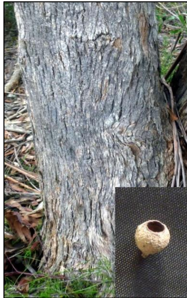
Eucalyptus piperita (Sydney Peppermint)