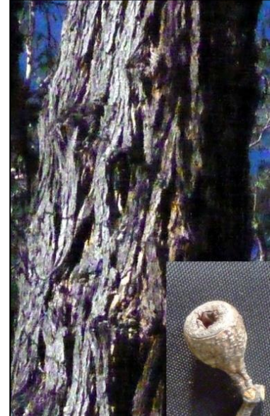
Eucalyptus sieberi (Silver-top Ash)