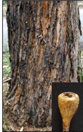
Eucalyptus microcorys * (Tallowwood) Bark - fibrous