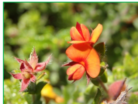
Above: Flowers at Kamay National Park, November 2018 APS Gathering.