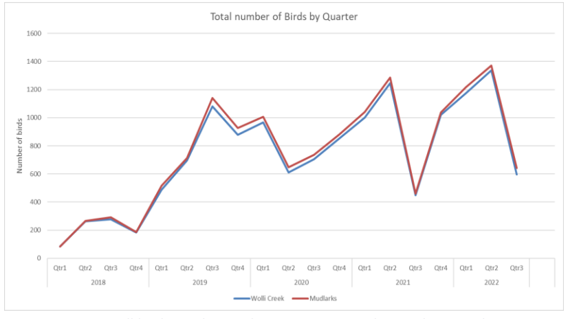
13 overall bird populations by quarter

This year, I expanded the data analysis to include data from the Cooks River Mudlarks as well. They only have data from about 2018 so we focussed more on variations between the two areas. We also looked for any impact from the wet weather that we've been having.