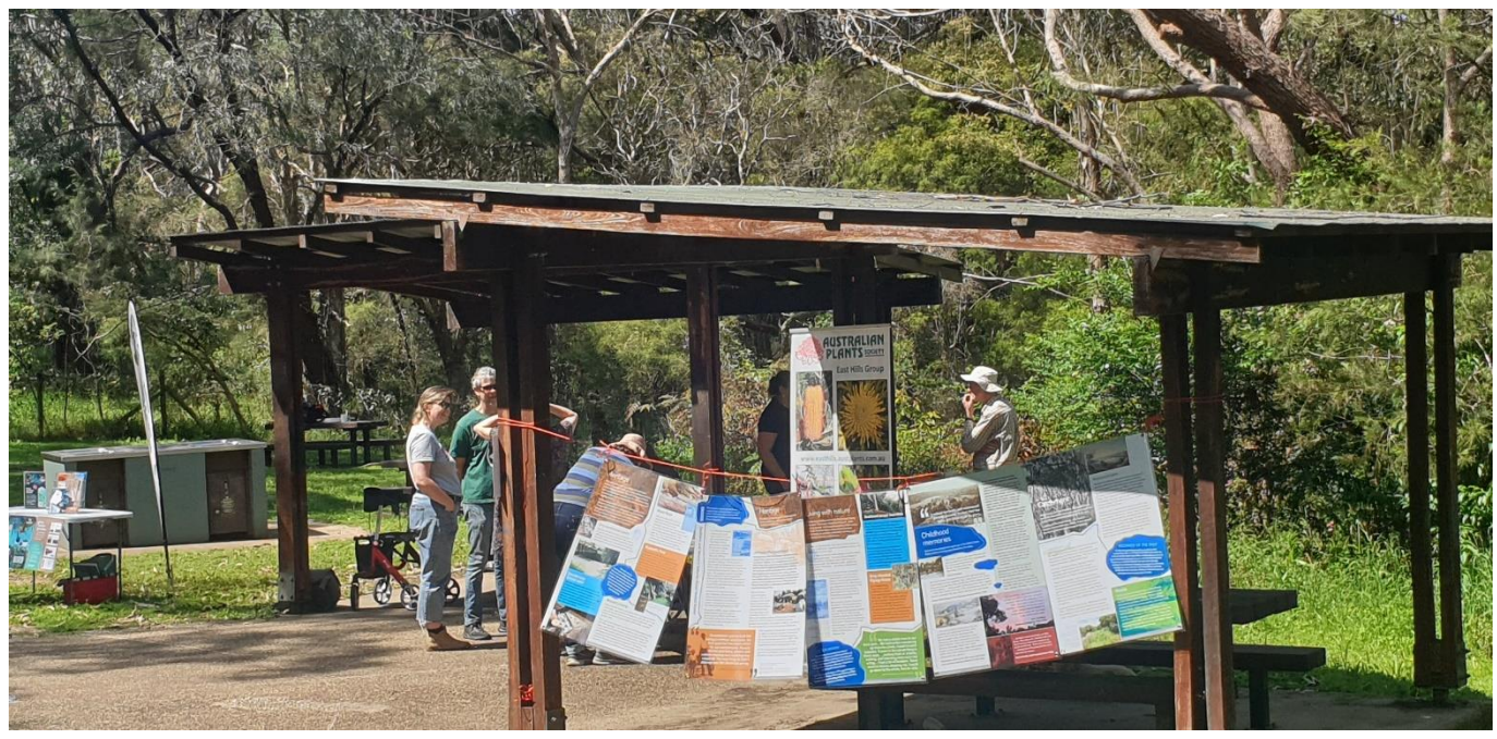
14 the picnic area at Girrahween Park, adorned with posters, from the NCC picnic

Search plants for a specific address, or search plants anywhere in Canterbury-Bankstown. If you select 'any address' you get a list of features to select from.