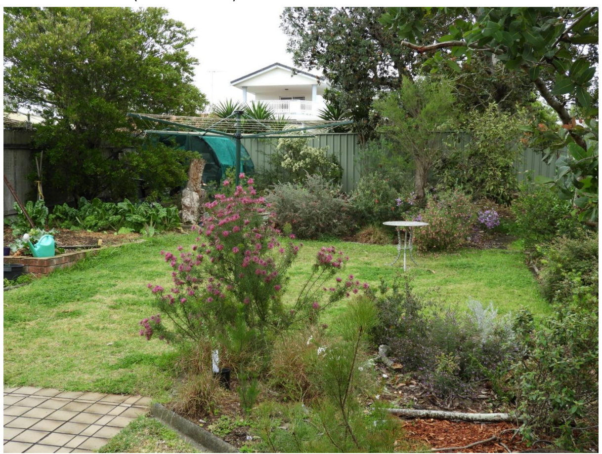
6 Back Garden with Melaleuca fulgens

We built piles of rocks, laid down earthenware pipes and scattered logs throughout the garden to provide habitat for insects and reptiles ; we try to suppress weeds with a layer of mulch which provides further habitat for lizards and invertebrates. There is a pond with native aquatic plants and three bird baths of different sizes in the garden. Over the years we have reduced the area of lawn and raised the mower blades to leave a deeper sward of grass and forbs. We enjoy watching rosellas eating the weedy seeds and magpies diving on worms in the grass. We don't use insecticides and only occasionally do I apply Roundup, to control onion weed ( Nothoscordum ).