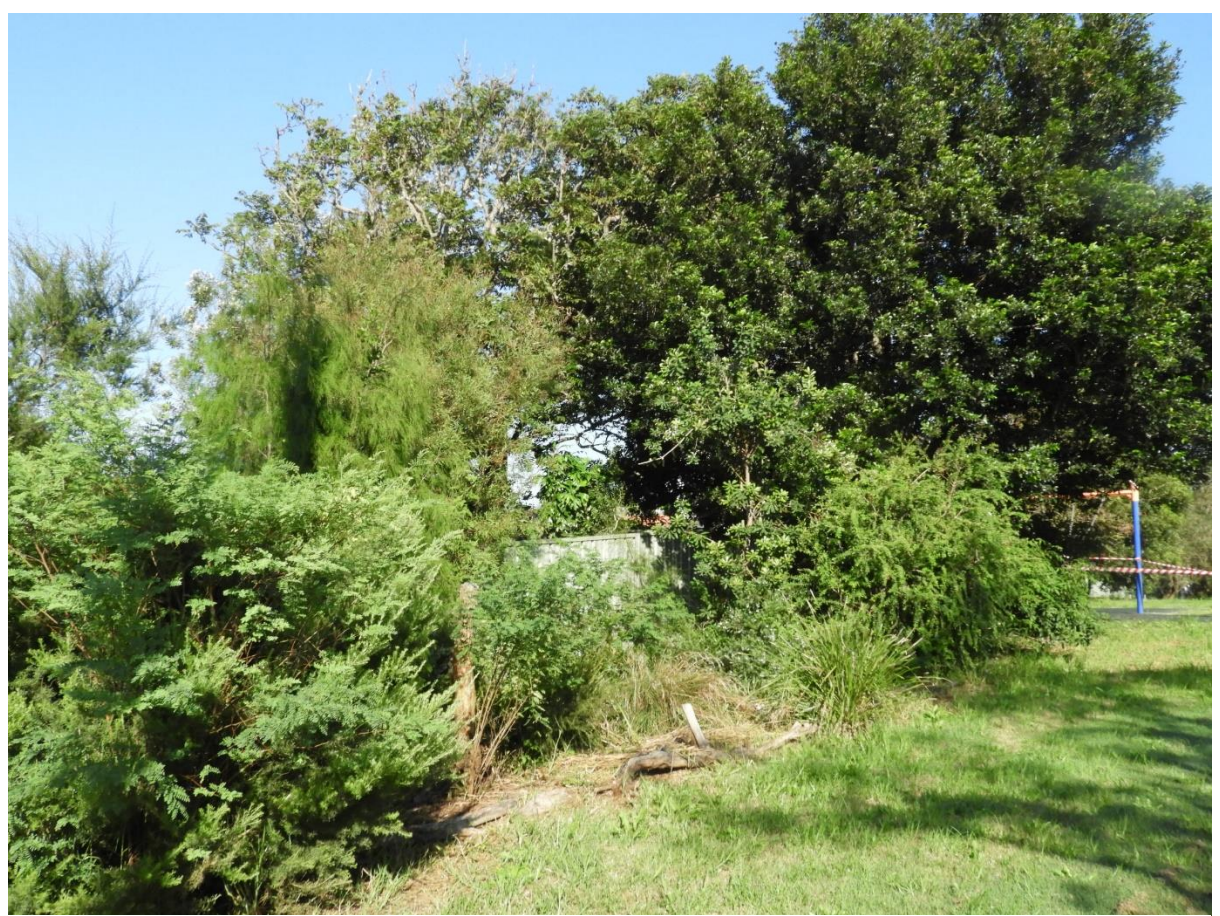
7 the wildlife corridor next door

Our Allocasuarinas are utilised by many of the birds – as roosts as well as a source of seeds and insect food. We have a good population of pollinators that visit a wide variety of flowers; our Angophora hispida was a mecca for nectar-feeding insects . Eight species of lizard and two frogs have been recorded in the garden at some time over the past 40 years.