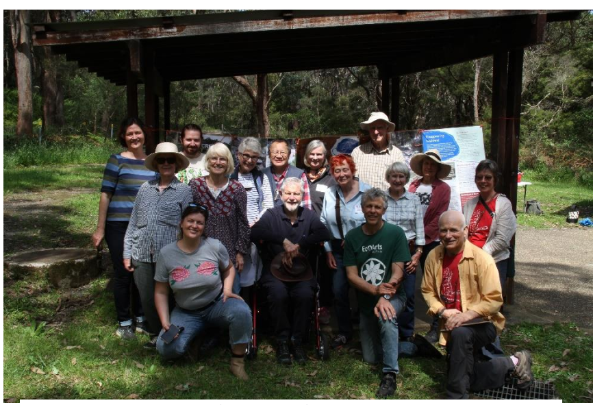
15 The group at the NCC Picnic

https://www.austplants.com.au/Harbour-Georges-River