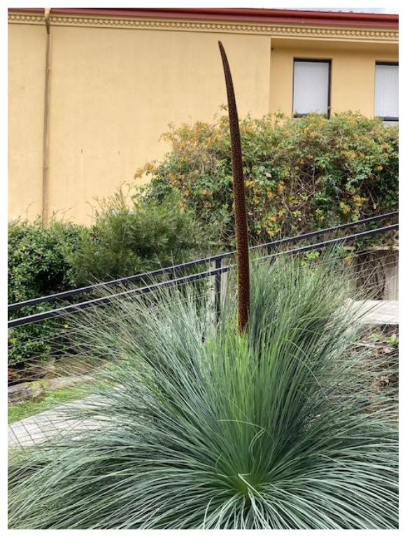
5 Xanthorrhoea flower spike

After building the brick walls in the back garden, Des build the rain forest area. Needing 30 CM all over of mulch for the rainforest base, he first had delivered 13 free truckloads of mulch. These were moved 3 times with a 3 month wait, after being advised by the RBG that this was what they did. 2 water tanks equal to 10,000L were also installed around this time at the bottom of the garden.