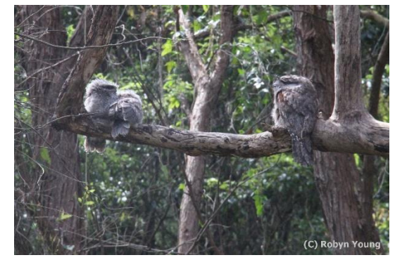
8 Tawny frogmouth family

A family of Tawny frogmouths sitting in a tree quite near the park. A parent and two small grey fluffy babies. Their activities moving up and down the branch they were sitting on kept people quite entertained during breaks in eating and talking.