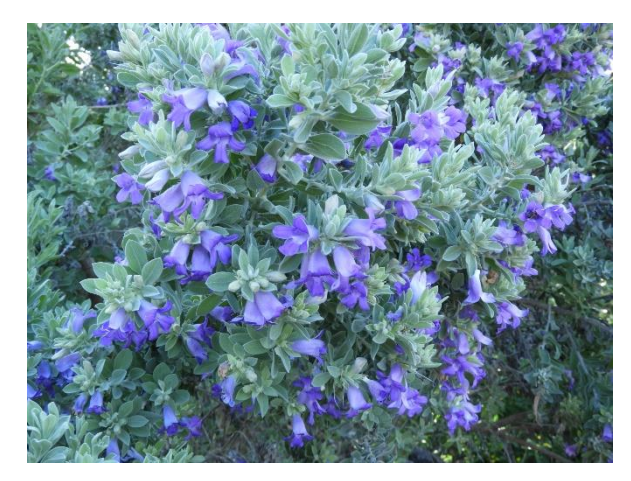
11 Eremophila chimera

Some years ago, an enthusiast grafted a cutting of an E.mackinlayi onto Myoporum root stock. Some time later, cuttings were taken from this plant and these were generally very vigorous and were widely distributed. I am sure this is what I have growing. It turns out that sometimes when grafting, genes from the host plant get incorporated into the main plant. This is known as a chimera. Usually, chimeras are unstable and are more a curiosity than anything else, but it seems that this chimera is a relatively stable plant. Some growers have noticed that Myoporum leaves can appear on the plant as well but experts recommend that they be removed.