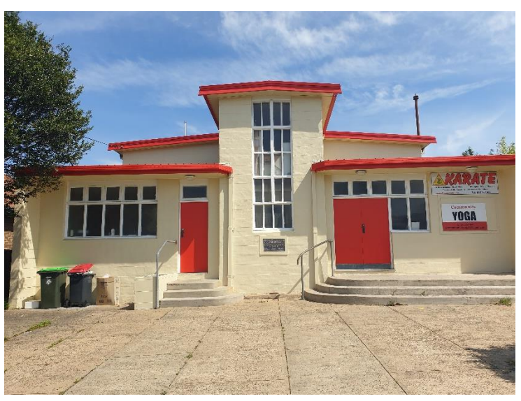
3 The Earlwood Uniting Church Hall

This is our first face to face indoor meeting in a long time, so lets make it a good one.