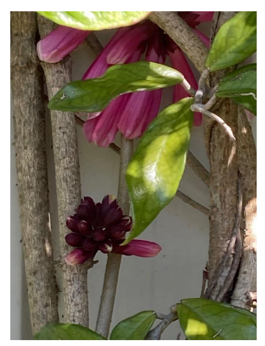
2 Fraser Island creeper Tecomanthe jillion