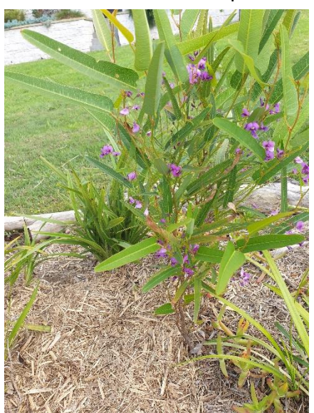
10 Hardenbergia shrub

Sometimes plants just don't read the rule book & grow in their own ways – Rafferty's Rules. Here are a few examples from our garden visits and other recent observations.