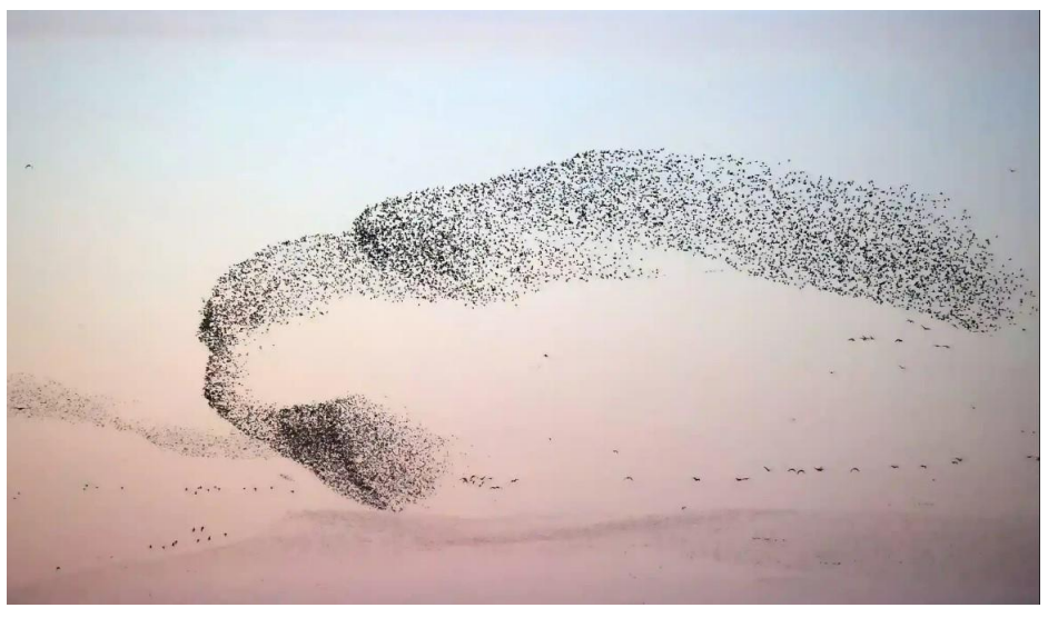
7 a murmuration of birds - not an alien invasion by giant dogs!