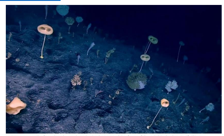
TET' sponges and soft corals make up what scientists have named the 'forest of the weird' in the deep Pacific Ocean

ET sponges & soft corals in the deep Pacific Ocean