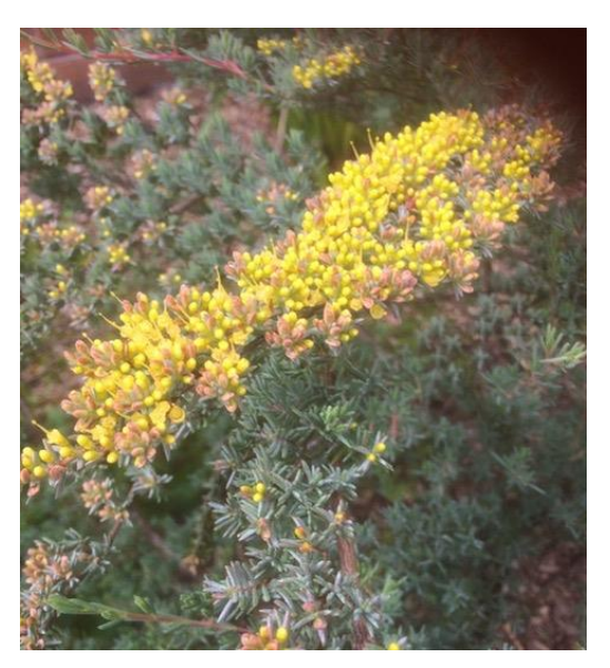
3 Homoranthus flavescens

Grevillea 'Kimberley Gold' . This hybrid developed from the West Australian native grevilleas – G.wickhamii & G.miniata may grow to 3 m in height & width in a sunny garden position. Members saw the shrub with its characteristic grey-green holly shaped leaves and yellow inflorescence in the October visit to the O'Connor front garden. On the APSNSW website are further details written by Dan Clarke with a much better photograph taken by Marie. https://resources.austplants.com.au/plant/grevillea-kimberley-gold/