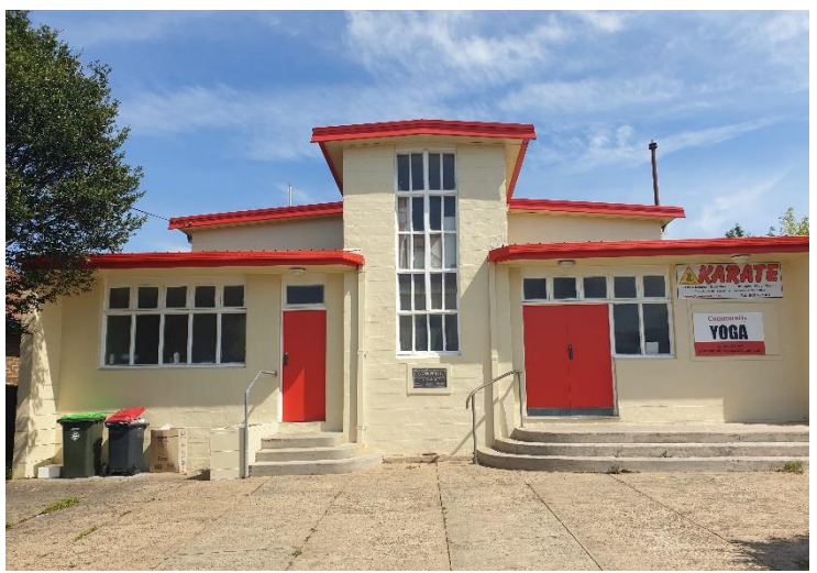
1 The Earlwood Uniting Church Hall

We're meeting at the church hall of the Earlwood Uniting Church. 16 William Street, Earlwood. It is 2 doors up from the church (away from Earlwood shops). It's a large space with a good kitchen, tables & chairs & a stage.