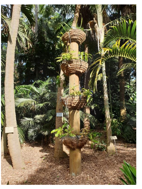
1 Rainforest in baskets.