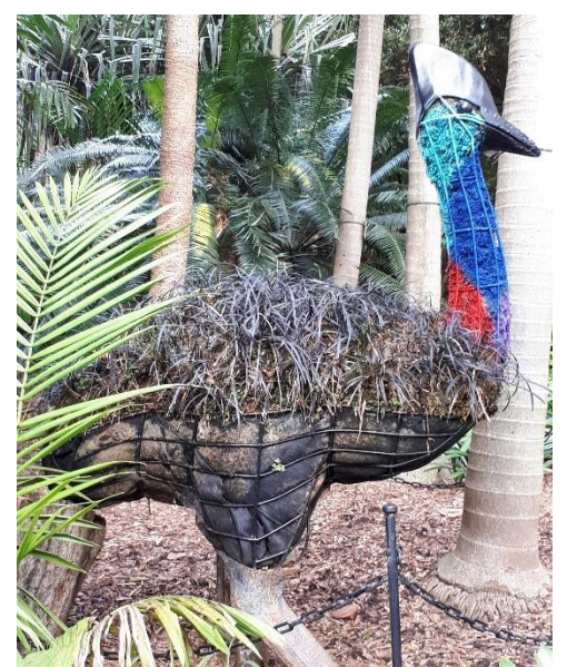
4 Rainforest topiary

Further on we were shown some of the Garden's heritage trees including the tallest – the Queensland Kauri Pine ( Agathis robusta ) – and two local species - Broad-leaved Paperbark ( Melaleuca quinquenervia ) and Red Cedar ( Toona ciliata ); the latter prompted discussion of their