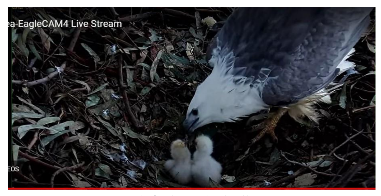
7 taken from the Live Feed 20 July, midday

A pair of sea eagles has been nesting in the bush at Homebush Bay for a number of years. Its near the Birdlife Centre and they've set up a camera system so you can watch every