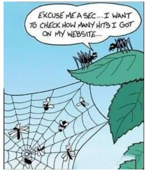
9 from Armidale Summer Newsletter

There has not as yet been any direction from the Board on this proposal. There may be something in the next state e-newsletter.