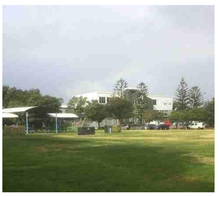
1 The picnic area on Arthur Byrne Reserve where I suggest we meet.

South Maroubra Surf Club building is in the background, parking area is adjacent to this. The road into the parking area is at the roundabout at the junction of Marine Parade and Fitzgerald Avenue, Maroubra Beach.