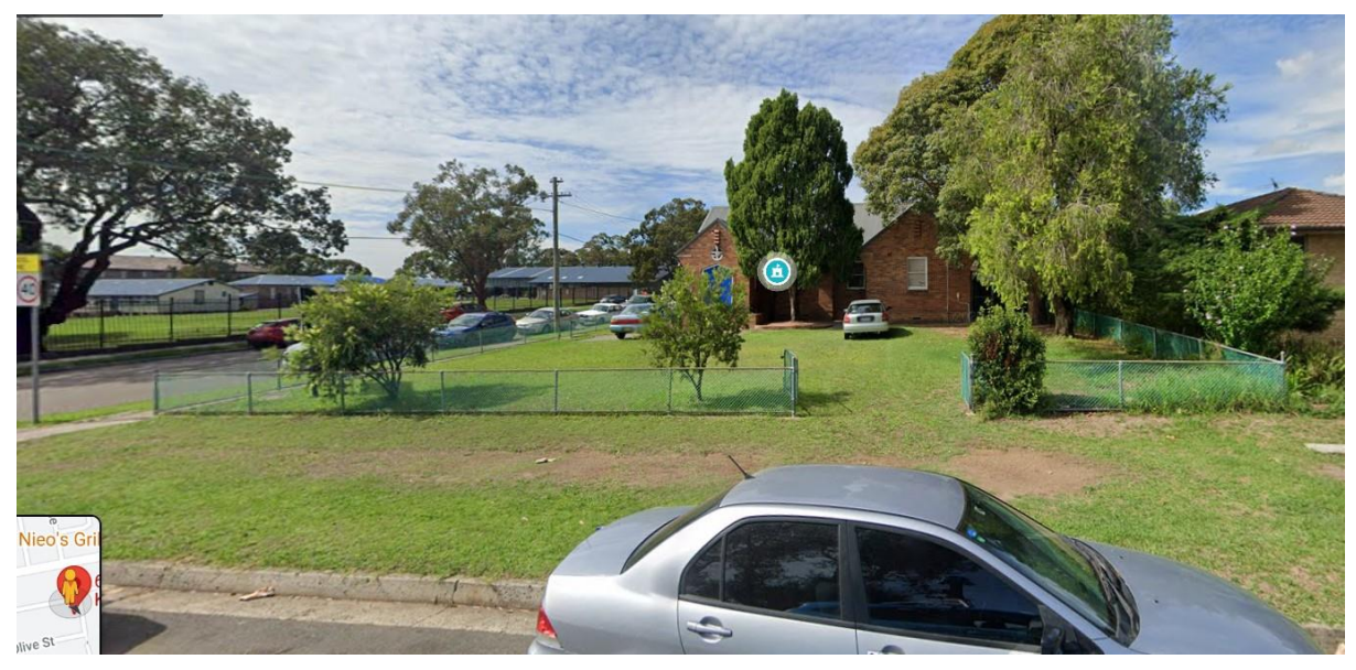
Figure 5 The Church grounds - photo from Google Maps, so a bit out of date. There is now a sign on the street corner.

The Campsie Earlwood Clemton Park Congregation (CECP) of the Uniting Church wish to create an indigenous community garden as a meeting place and listening space and plant it with indigenous fruit trees and other plants. They are planning the garden at Clemton Park Uniting Church, 6 Dunkirk Avenue, Kingsgrove, (Corner of Miller St). They intend to use permaculture principles to build the garden.