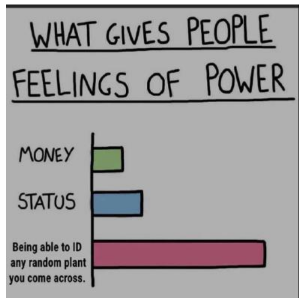
8 from Armidale Autumn newsletter