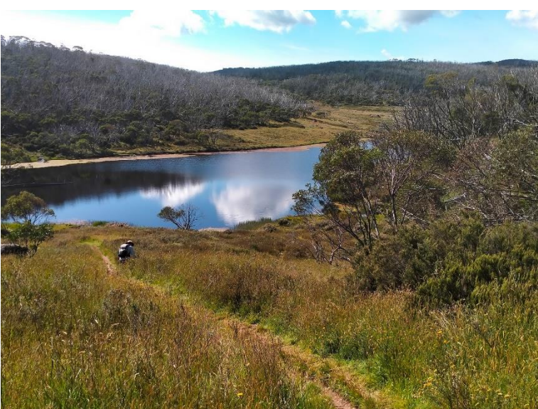
Snowy Mountains scenes, photos by Graham Fry